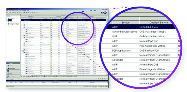
Enforcement Policy Editor

Allot's DART engine, embedded in the platform inspects every single packet and classifies traffic per application, user, IP address, location, and by any static or dynamic policy element you define. Allot's extensive signature library identifies thousands of web applications and protocols and also supports user-defined signatures. Automated DART protocol pack updates from the Allot cloud keep your deployment up to date with the latest application and web developments to ensure accurate traffic classification.