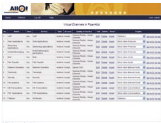
NPP self-provisioning "My Pipe" view